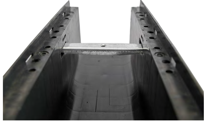
2. Slide the lockdown piece into the slots inside the channel.