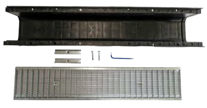
1. You will need a 6mm allan key & your channel/s, grate/s & fixings.

The 601 channel & grate features a 2 point security lcokdown to keep the grate rattle free and locked securely from unauthorised access. The lockdown is simple to install & uninstall with an allan key, allowing ease of access to the channel for cleaning.