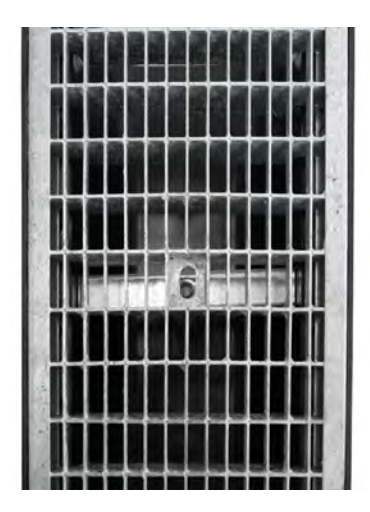
3. Insert the grate into the channel, making sure to line up the hole in the grate with the top of the lockdown piece.