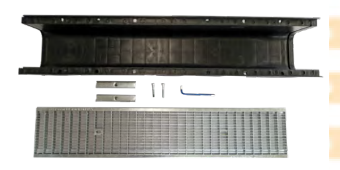
1. You will need a 6mm allan key & your channel/s, grate/s & fixings.

The 601 channel & grate features a 2 point security lcokdown to keep the grate rattle free and locked securely from unauthorised access. The lockdown is simple to install & uninstall with an allan key, allowing ease of access to the channel for cleaning.