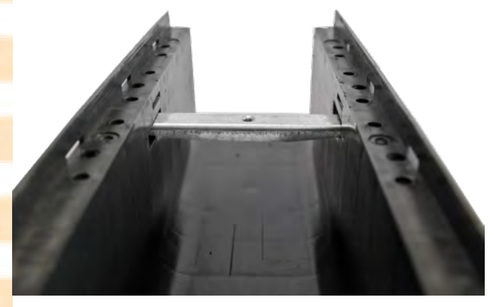
2. Slide the lockdown piece into the slots inside the channel.